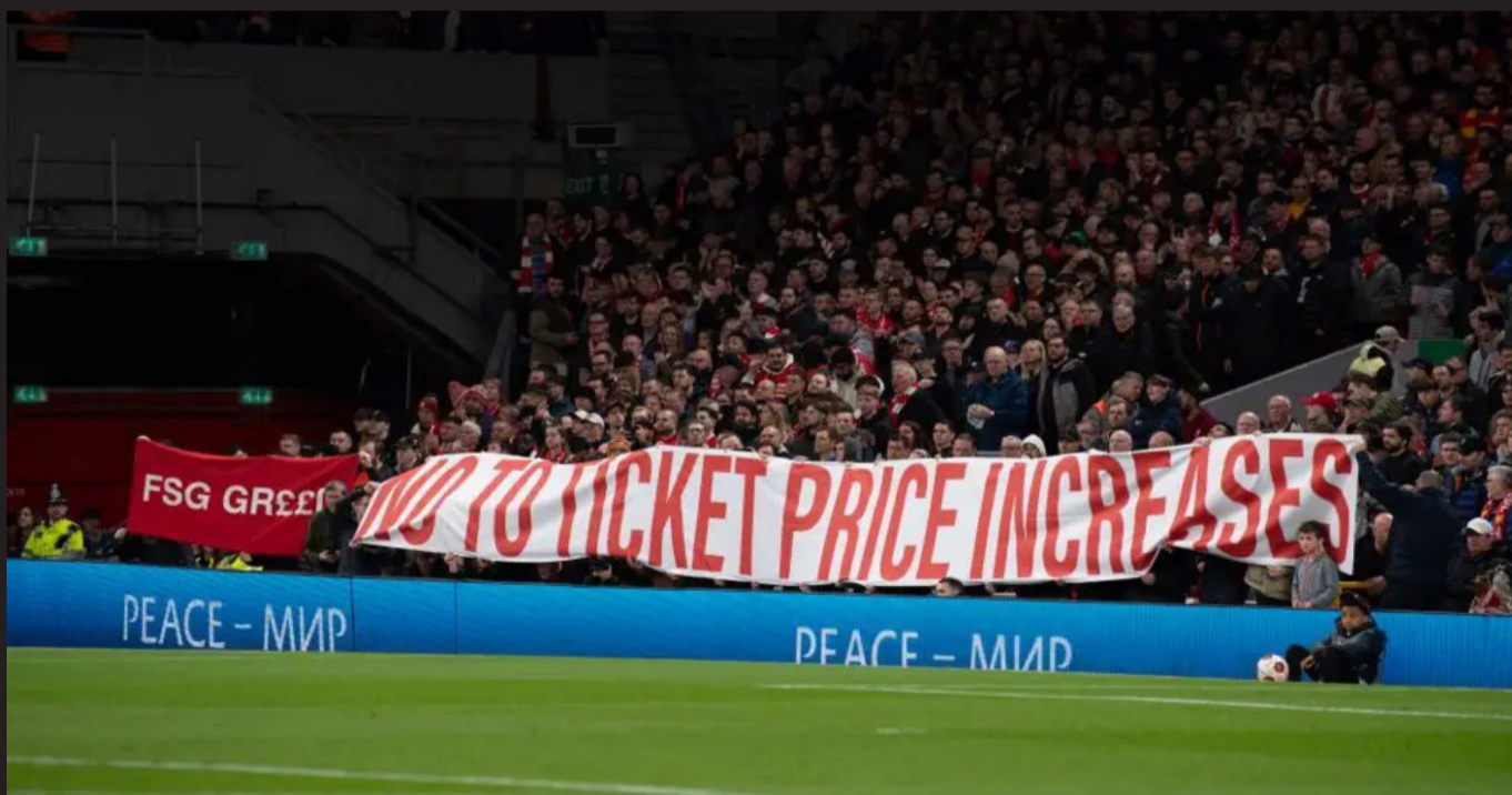
Liverpool supporters have protested against ticket price increases on multiple occasions under the ownership of Fenway Sports Group

day tickets, in the Anfield Road Stand and Main Stand respectively, are priced at £30 and £62.75.