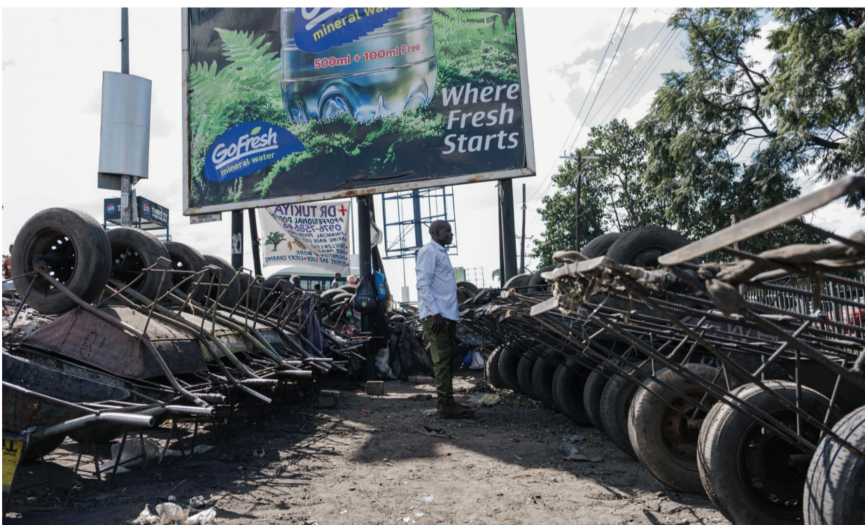
Mr. Chisenga Mlutula of Mandevu stands among a fleet of wheelbarrows used in a local transport business he operates with two partners. The venture, which owns more than 200 wheelbarrows, has created a source of income for many youths who ferry goods for traders purchasing merchandise at the nearby market.