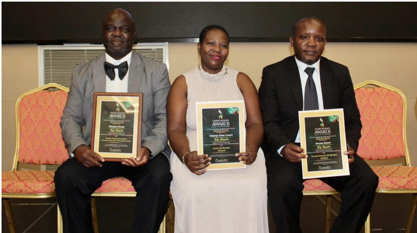
FILE: Termite staff pausing for a photo after their victory

and inclusive growth through its Labour Day message.