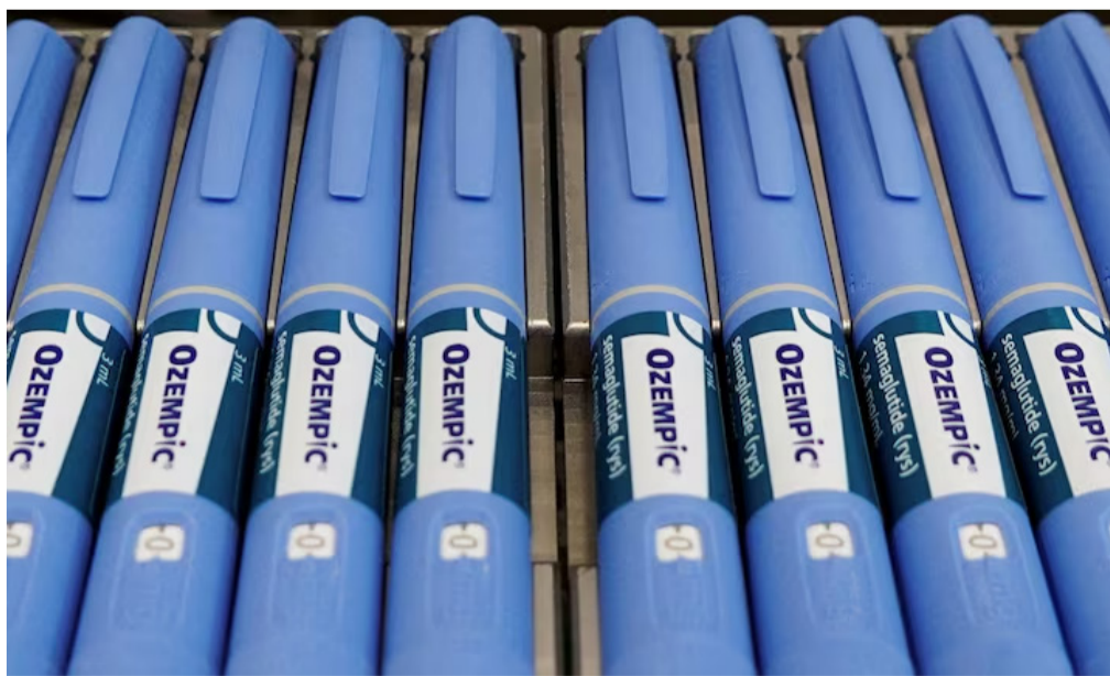
Pens for the diabetes drug Ozempic sit on a production line to be packaged at the Danish drugmaker Novo Nordisk's site in Hillerod, Denmark, September 26, 2023.

It does not stock the injectibles in kiosks because they need to be refrigerated, unlike the pill versions.