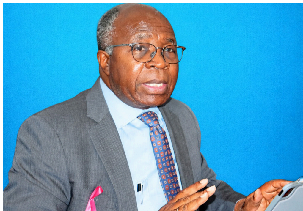
Minister of Finance and National Planning Situmbeko Musokotwane

"I wish to commend members of staff at the Ministry of Finance and National Planning for the compassion, unity and sense of duty they demonstrated