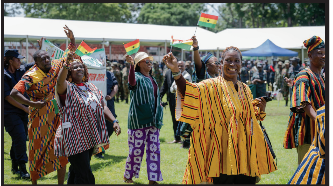
Fugu shines as Ghanaians participating in the Fugu and Kente exhibition in Lusaka join the march past during Women's Day celebrations.

She expressed optimism that the remaining banknotes will be exchanged before the deadline, with authorities expecting to recover close to 100 percent of the old currency by the end of the exchange period.