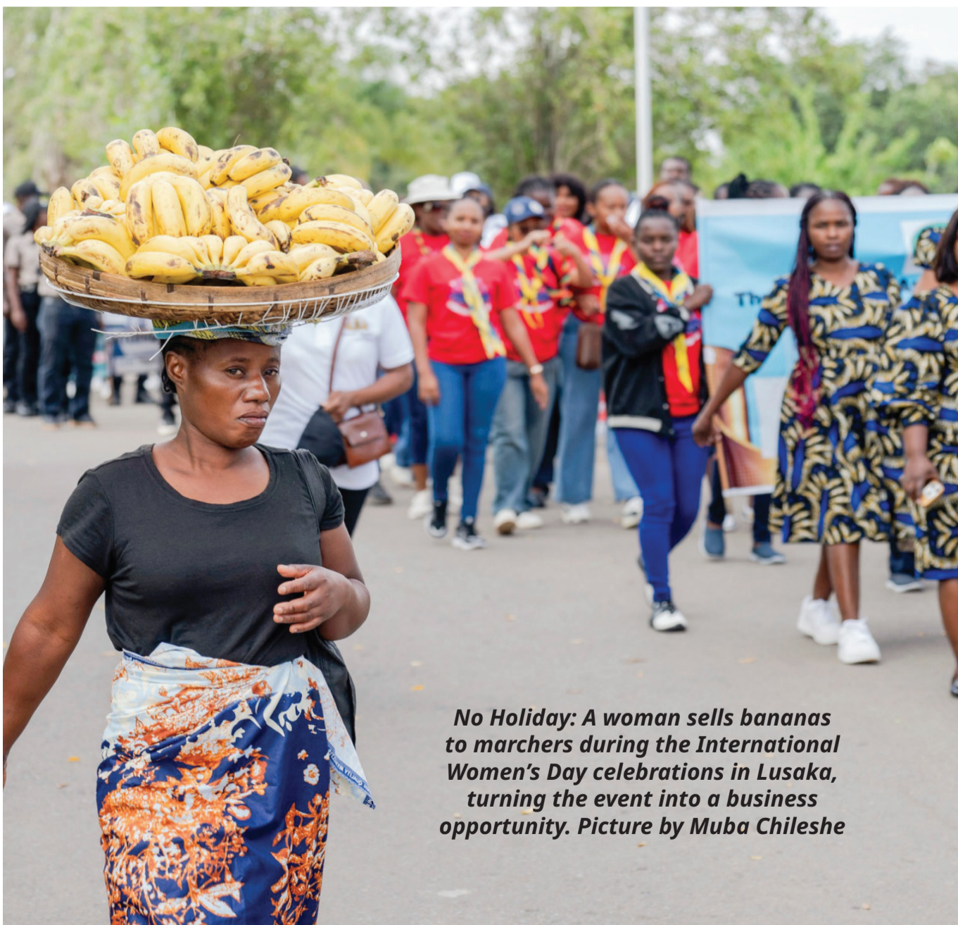
No Holiday: A woman sells bananas to marchers during the International Women's Day celebrations in Lusaka, turning the event into a business opportunity.