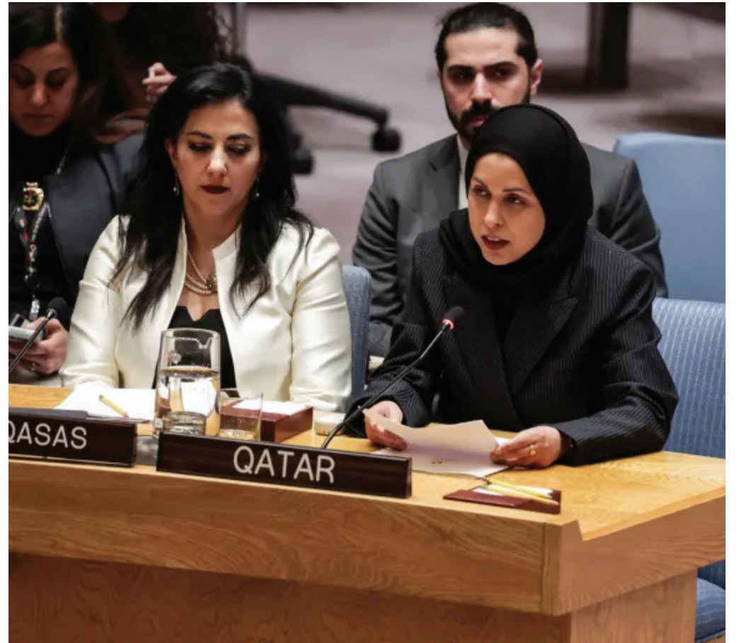
'The Security Council must act [and] fulfill its responsibility,' says Qatar's UN ambassador, Sheikha Alya Ahmed bin Saif Al Thani

Q atar has called on the United Nations Security Council (UNSC) to take immediate steps to halt Iranian attacks on countries across the Middle East, warning that a failure to act sends a "dangerous signal".