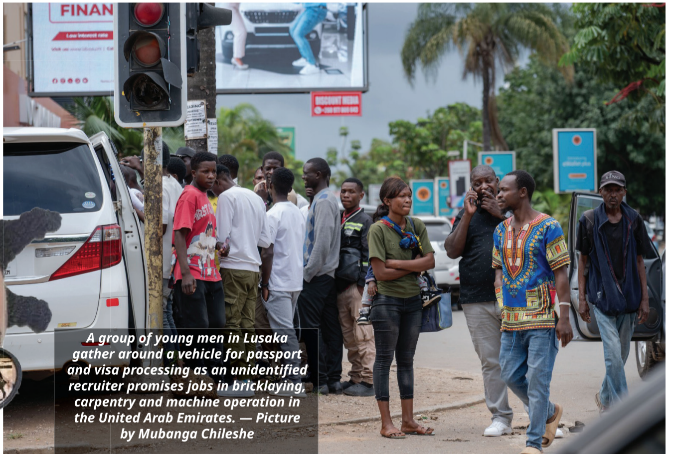
A group of young men in Lusaka gather around a vehicle for passport and visa processing as an unidentified recruiter promises jobs in bricklaying, carpentry and machine operation in the United Arab Emirates.