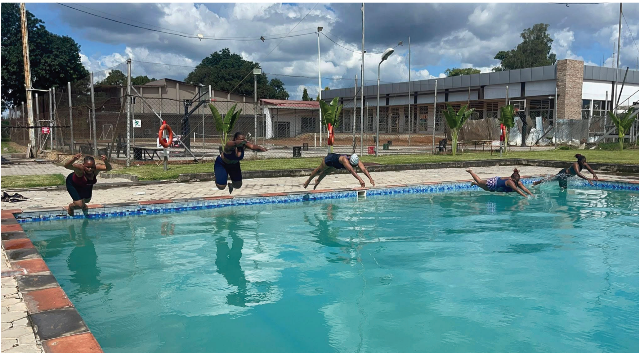
Participants head to the waterline for the women's swimming event at the 2026 ZALASA Games, where Lufwanyama Town Council delivered a standout performance to clinch gold through determination and athletic excellence.

By Alexis Chilumbwe Lufwanyama Town Council delivered a standout performance at the 2026 Zambia..." (Full story on P7)