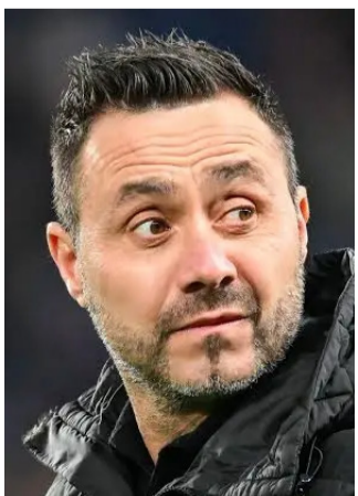
Roberto de Zerbi

Tottenham Hotspur are in talks with Roberto de Zerbi in a bid to make him their new permanent head coach, according to sources.