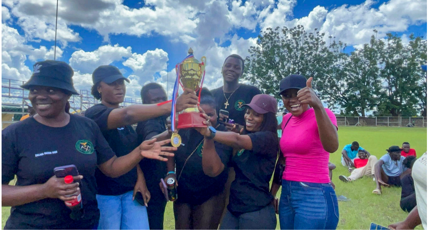
Champions of the women's swimming event at the 2026 ZALASA Games, where Lufwanyama Town Council delivered a standout performance to clinch gold through determination and athletic excellence.