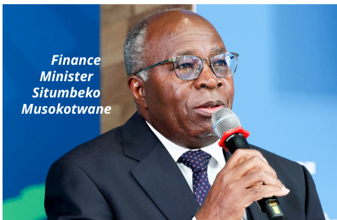
Finance Minister Situmbeko Musokotwane

He added that the reform will help generate a clearer yield curve — a key indicator that reflects borrowing