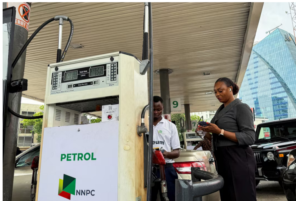
A service employee is filling a car with fuel at a petrol station in Lagos, Nigeria, Monday, March 23, 2026.

vulnerable to price increases. The government has chosen not to reintroduce fuel subsidies, focusing instead on long-term market reforms and limited short-term relief measures.