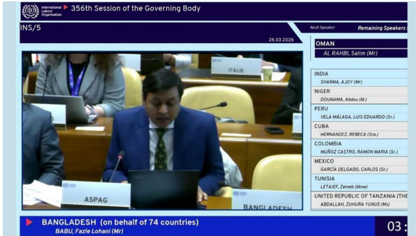
As the leader of this 74-nation bloc, Bangladesh strongly advocated for the abolition of the 10 undemocratic permanent seats currently held in the ILO

Acting as the spokesperson for a diverse group of nations across South America, Africa, Asia, Europe, and the Middle East, the Permanent Mission of Bangladesh in Geneva raised a powerful demand for the democratization of the ILO, the United Nations, and other international organisations, said a press release on Friday.